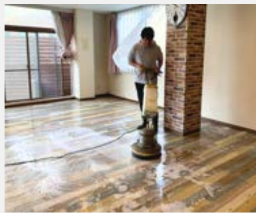
Rooms with different character

The common areas are cleaned 7 days a week by a cleaning service and our staff, and are always kept clean. We also ask our tenants to keep the common areas clean and tidy.